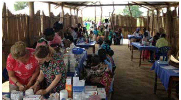
Temporary Tent Clinic, Uganda