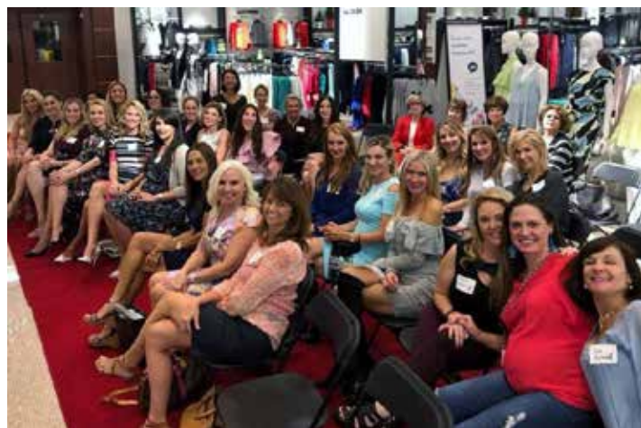
A great time was had by all at Nordstrom for our Sip & Shop Fundraising event.