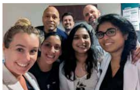
Physicians Regional Hurricane Recovery Team A

I have seen how we have been resilient so many times in the past 6 years. We met the challenges of a changing NCH healthcare system, Hurricane Irma, the COVID-19 pandemic, for those at NCH the change to EPIC electronic healthcare records, and now Hurricane Ian with the surge we will always remember. Collier County physicians will continue to be resilient, no matter what the crisis at hand.