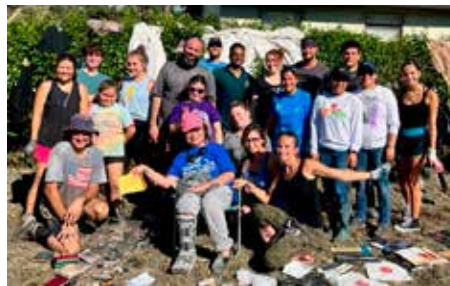
NCH's CCU team cleans their nursing director's home post-hurricane

Now that the storm is a month behind us (at the time of writing), we have had a chance to reflect, awaken to the realities of the situation. Many of us were initially in a state of shock. It can feel like the situation didn’t happen, “like a bad dream” and “surreal”. During a natural disaster our initial response is “fight or flight”. We may not process our emotions and feelings until much later. Some experience grief, loss of the life they had,