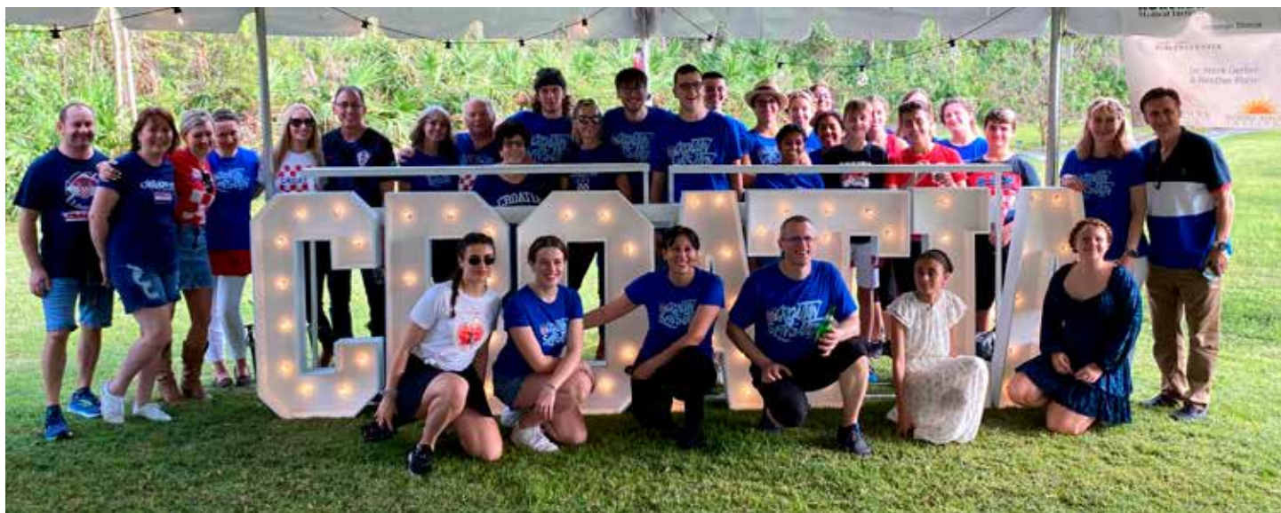
Croatia Festival Volunteers

Kudos to our local CCMS physicians for their dedication, philanthropy, and commitment to making a significant difference in the lives of the Croatian and Nigerian children in need of love, encouragement, and the basics to survive, as well as those in our Southwest Florida communities with special needs to help them survive and get back on their feet after Hurricane Ian.